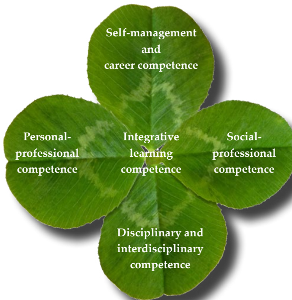
Figure 2. Components of Competence for Life

The vertical dimension consists of the disciplinary/interdisciplinary knowledge base and the personal ability to manage oneself and one's career. The knowledge base is fundamental and should not be neglected. The horizontal dimension is the dimension of professionalism, and consists of the personal and social competence side of that.