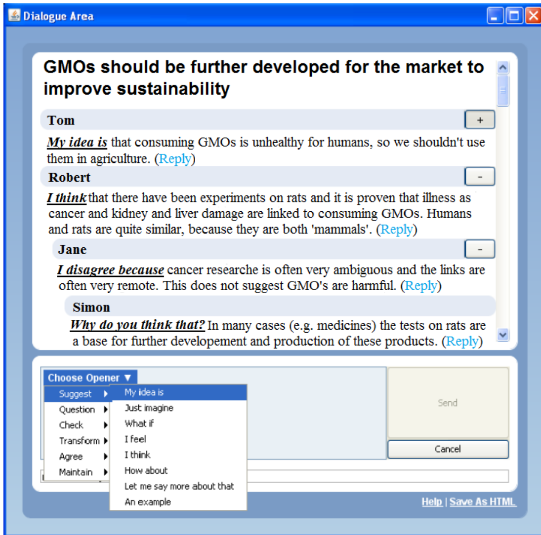
Figure 1. A screenshot of the digital dialogue game with associated sentence opener.

free discussion board (for example McAlister, Ravenscroft, & Scanlon, 2004; Ravenscroft, 2011; Ravenscroft & McAlister, 2006).